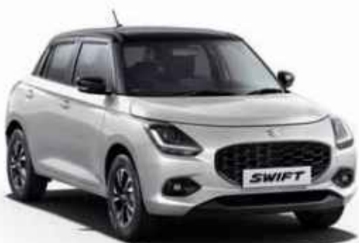
/ Pearl Arctic White with Midnight Black Roof