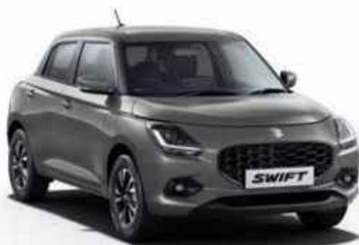
/ Magma Grey