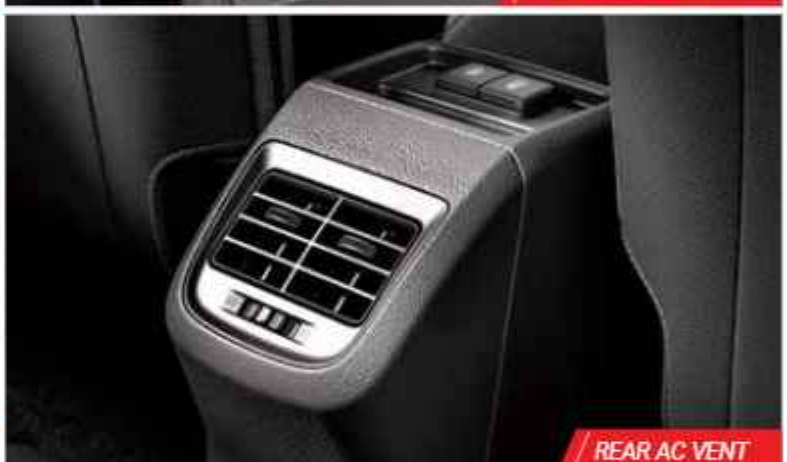
REAR AC VENT