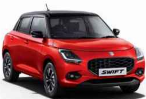
/ Sizzling Red with Midnight Black Roof