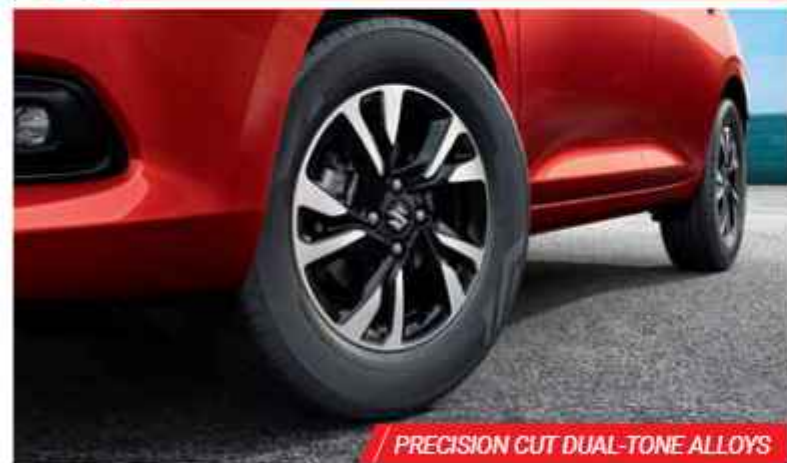
PRECISION CUT DUAL-TONE ALLOYS