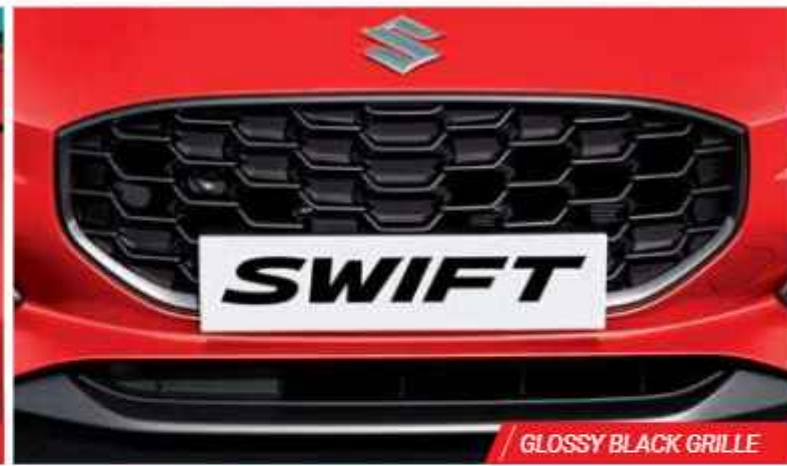
GLOSSY BLACK GRILLE