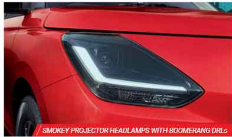
SMOKEY PROJECTOR HEADLAMPS WITH BOOMERANG DRLs

With its bold stance and sporty design, the Epic New Swift is quite the looker. It is pure passion crafted into an expression of thrill. As it approaches, heartbeats go up, and you know it is something special.