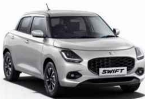
/ Pearl Arctic White