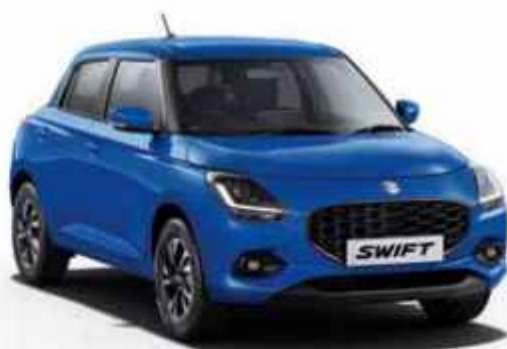
/ Luster Blue 11