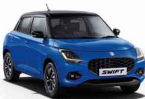
/ Luster Blue with Midnight Black Roof