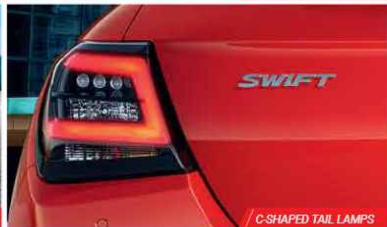
C-SHAPED TAIL LAMPS