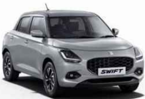
/ Splendid Silver