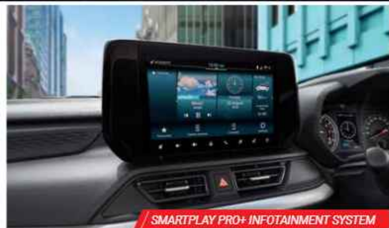
SMARTPLAY PRO+ INFOTAINMENT SYSTEM

No words can describe what you'll feel when you enter the Epic New Swift. But we'll try. This car is designed with ample space keeping your comfort in mind and its Sporty All-Black Interiors make every drive truly stylish. The real head-turner is the sleek and futuristic center console, with a driver-oriented cockpit for easy access.