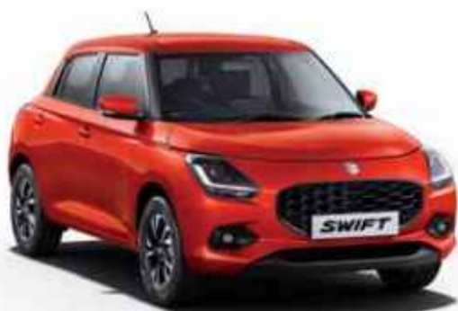
/ Novel Orange