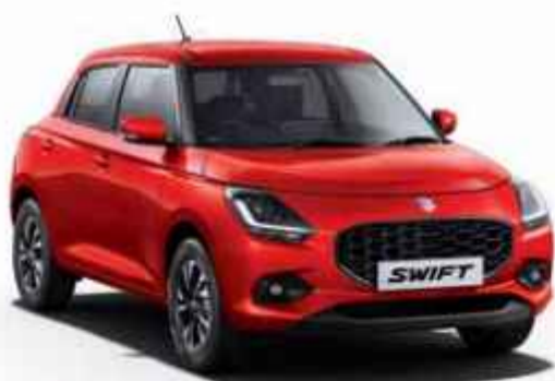
/ Sizzling Red 11